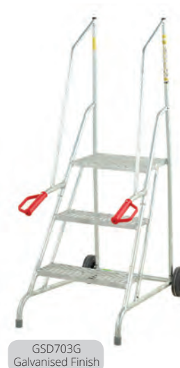
GSD703G Galvanised Finish