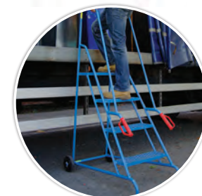
Open rear allows step through access to a loading bay or lorry etc