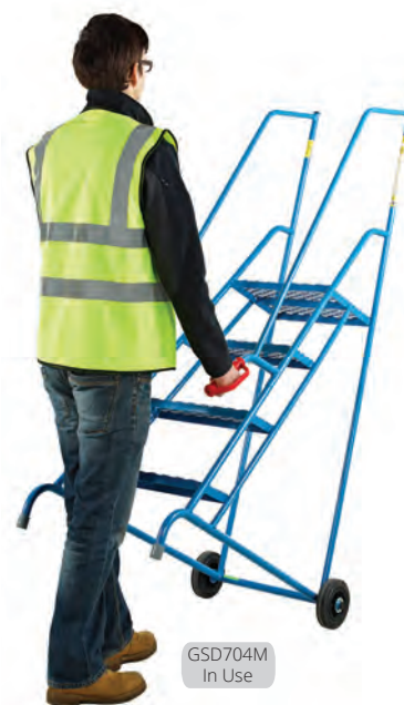
GSD704M In Use