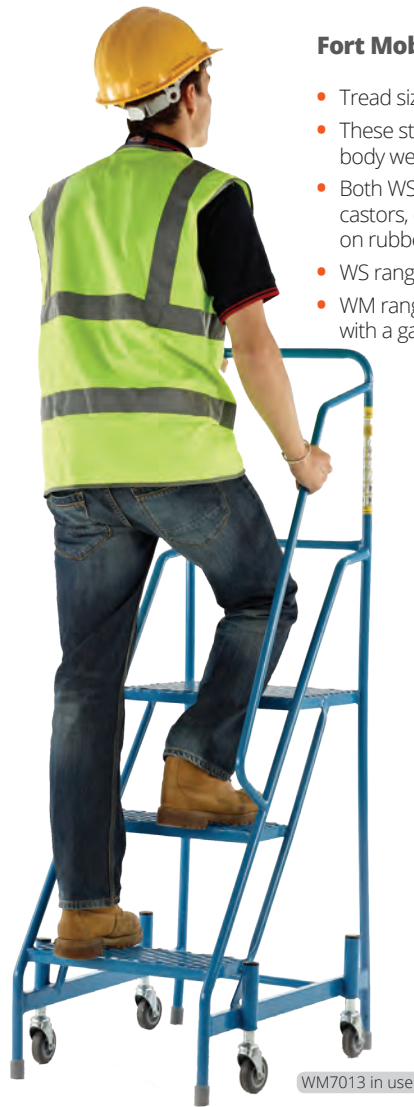
WM7013 in use