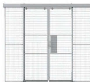
Double Hinged Door