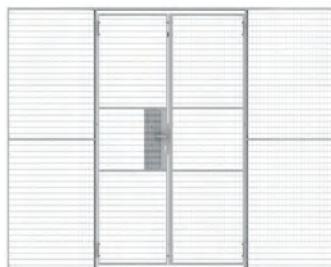
Double Hinged Door