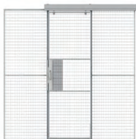
Single Sliding Door