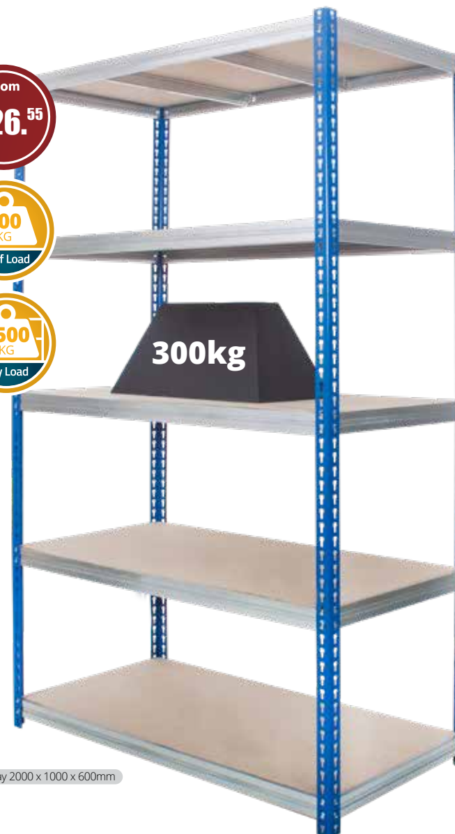
© Kwikrack bay 2000 x 1000 x 600mm