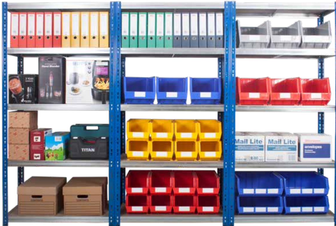
Three bay run of Kwikrack 2000 x 1000 x 450